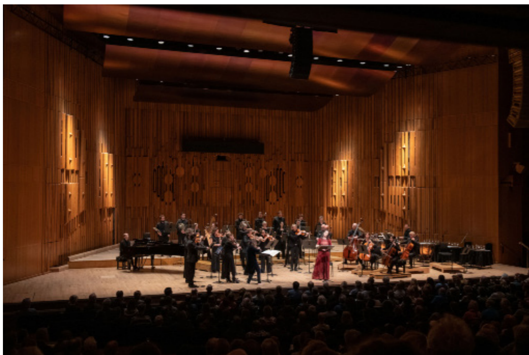
Maria Mater Meretrix, 16 April 2023, Patricia Kopatchinskaja, Barbican Hall, London, UK.