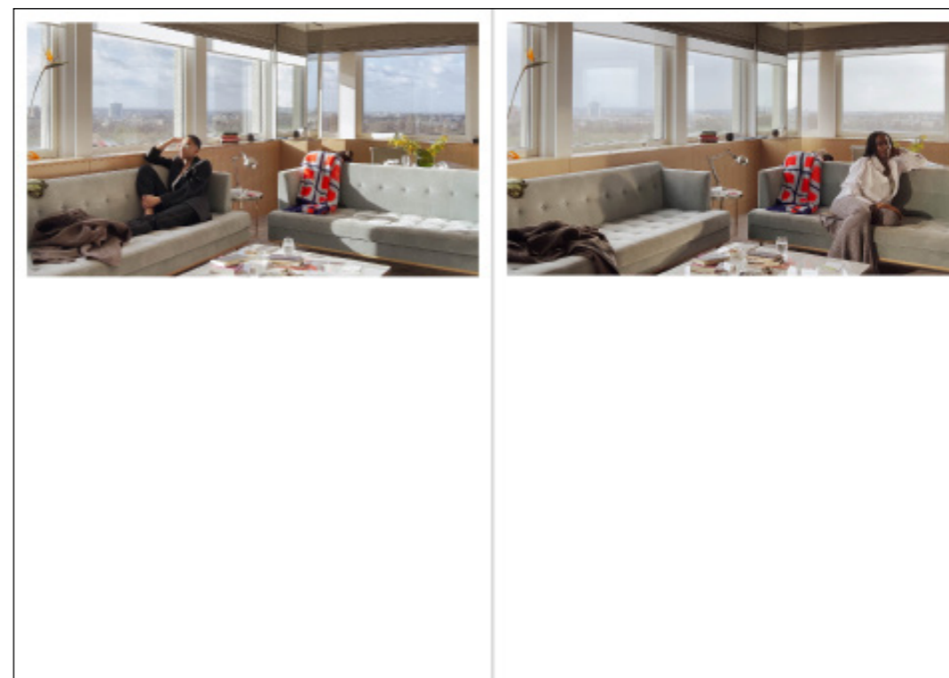
Queen For A Day , ©Deborah-Joyce Holman, 2023