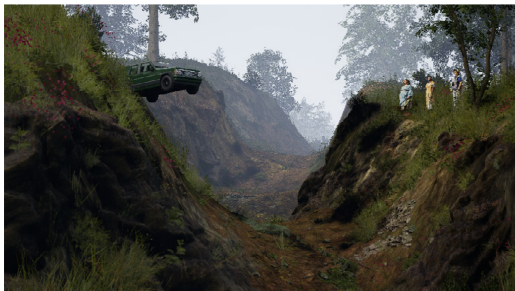
Ditch Me , ©Rhona Mühlebach