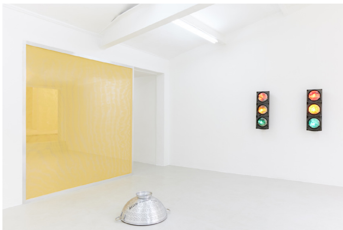
A Story Backwards , 2023, RM. Auto Italia, London, UK. Courtesy of the artists. Photographer: Henry Mills